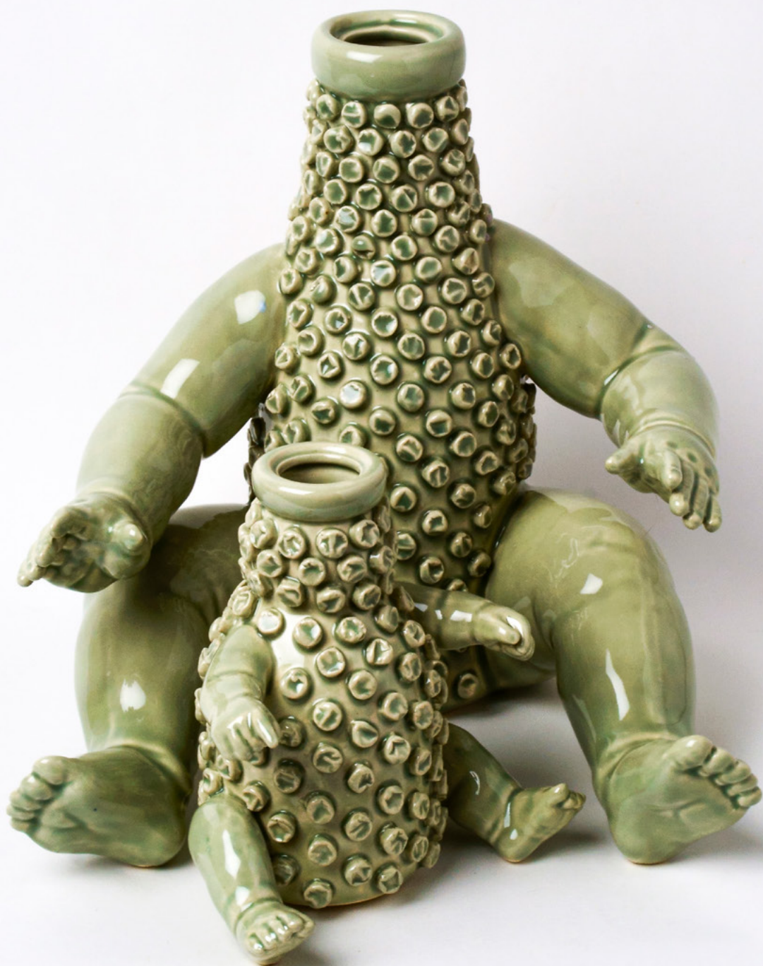
Bubble Wrapped Babies 2023